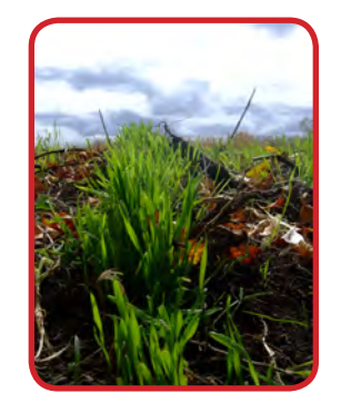
Leaf litter left on your lawn can add nutrients into the soil and acts as an insulator for your grass.

Thatch removal. Before over-seeding, be sure to remove any over-abundant thatch. Thatch is a tightly intermingled layer of living and dead stems, leaves and roots which accumulates between the layer of actively-growing grass and the soil underneath. It is a normal component of an actively growing turf grass. Thatching requires that you either remove the dead grass with a lawn rake, or cut into the soil to provide air and proper circulation. If you do thatch prior to the winter months, the grass will recover