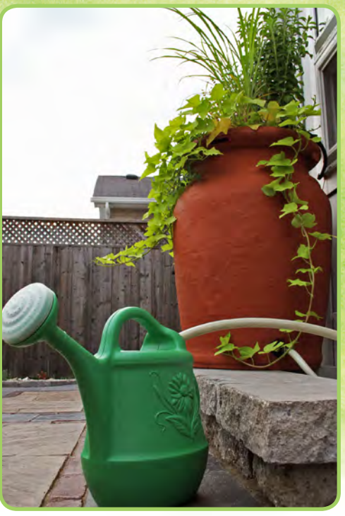
With the barrel elevated, water easily flows out of the hose near the bottom into the watering can. Nearby gardens and lawn areas can also be watered through this hose.

The downspout empties into the top of the barrel, which features a small garden.