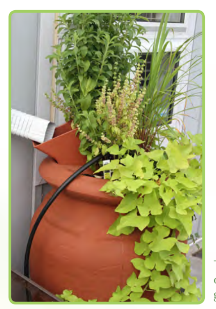
Preventing a large rush of water across the saturated ground during heavy rainfall reduces the amount of sediments and other contaminants that can be picked up and carried into the storm sewer.

The downspout empties into the top of the barrel, which features a small garden.