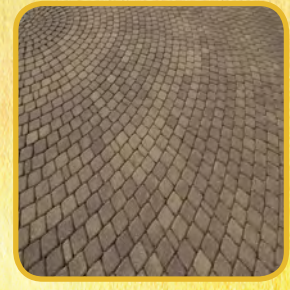
Circular paver blocks

Pervious concrete. Similar to pervious asphalt, pervious concrete reduces the amount of fine particles in the mix. The installation of this type of material requires professional and experienced installers, as the method is different from traditional concrete.