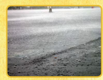
Hard, impervious surfaces channel rain and snow into water bodies. This runoff can carry high amounts of nutrients and other pollutants.

As rainwater runs across sidewalks, driveways, and roads, it picks up sediments, nutrients (phosphorus and nitrogen), and other contaminants, such as petroleum and residues. It then makes its way through ditches or storm drains into local waterways—'roads to rivers.'