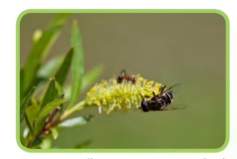
Native willows are an important food source for pollinators.

Bees and other pollinator populations face many threats that are contributing to their decline. These threats include parasitic mites, bacteria, pesticides, and a loss of wild space (habitat). It is important to provide a variety of shapes, colours, and flowering periods within the urban garden to offer food and shelter for this important group of species.