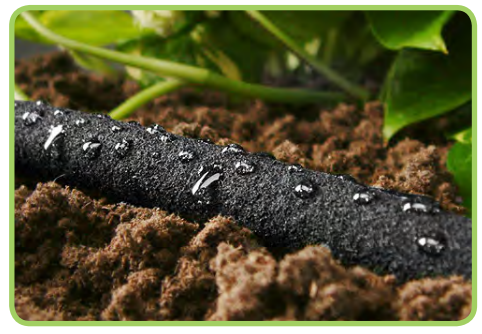
A soaker hose slowly releases water into the soil