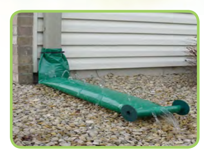
Automatic downspout extender

These extenders automatically roll out during rain events to disperse water from your gutters, and then rewind on a spool when the rain stops. Moving rainwater away from your home can protect your foundation and prevent erosion.