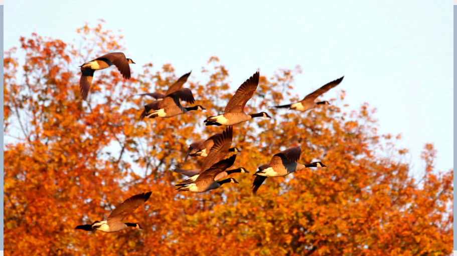
Canadian Geese migrating south for the winter.