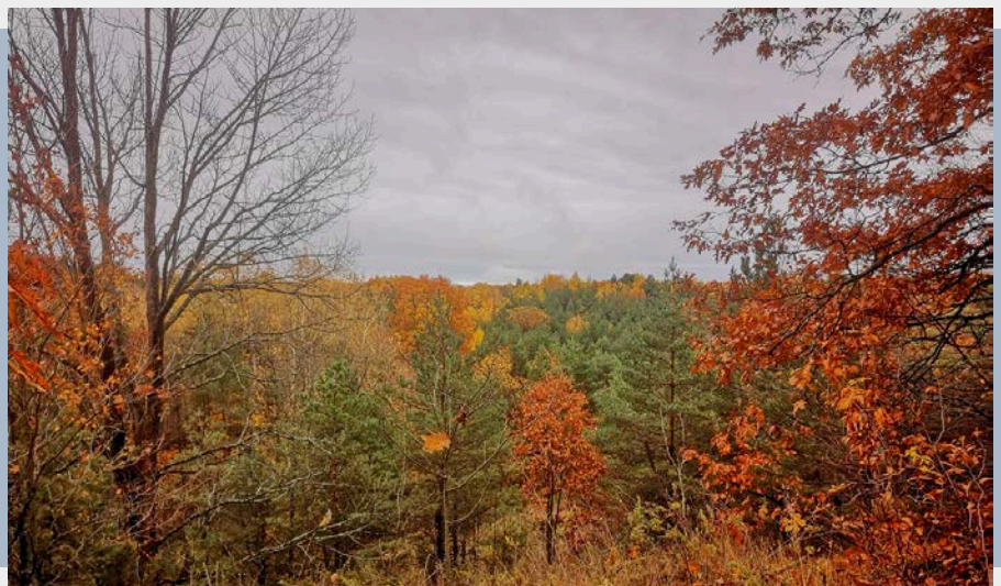
Fall colours at Durham East Cross Forest Conservation Area.