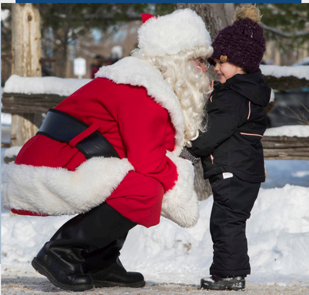
Santa visiting a young guest during Christmas at Ken Reid.

For more information on how Kawartha Conservation can help. Conservation Lands: conservationareas@kawarthaconservation.com General info: geninfo@kawarthaconservation.com Permitting: permits@kawarthaconservation.com Planning: planning@kawarthaconservation.com