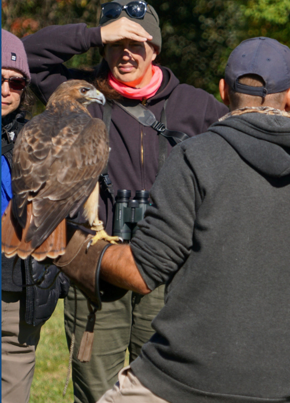
Birds of Prey demonstration during Fall Fest.