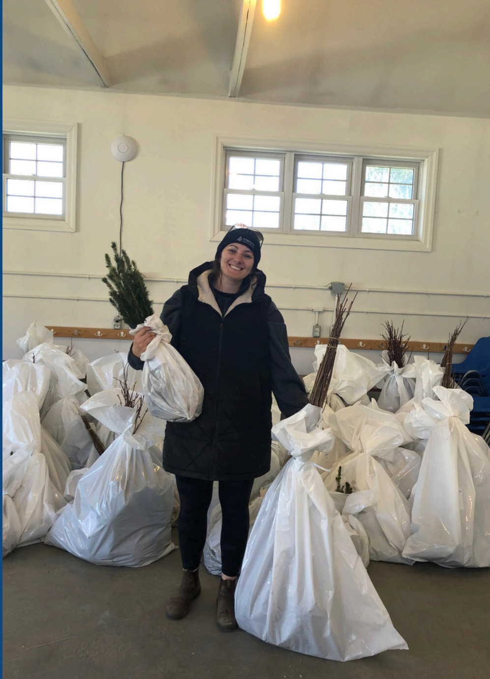
2024 Seedling Sale orders packed and ready to go.

For more information on how Kawartha Conservation can help. Conservation Lands: conservationareas@kawarthaconservation.com General info: geninfo@kawarthaconservation.com Permitting: permits@kawarthaconservation.com Planning: planning@kawarthaconservation.com