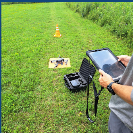
Integrated Watershed Management team undertaking drone flight training.

Staff have been busy preparing for using Remotely Piloted Aircraft Systems (aka drones) to monitor erosion and sediment control needs at local construction sites. This initiative is a key outcome from the City of Kawartha Lakes Implementation Action Plan, and is intended to help improve water quality in our lakes and streams by reducing dirty runoff from construction projects. We have just finalized a corporate drone operations policy, which provides guidance for staff on proper piloting techniques, pre flight planning, and safe and legal operations.