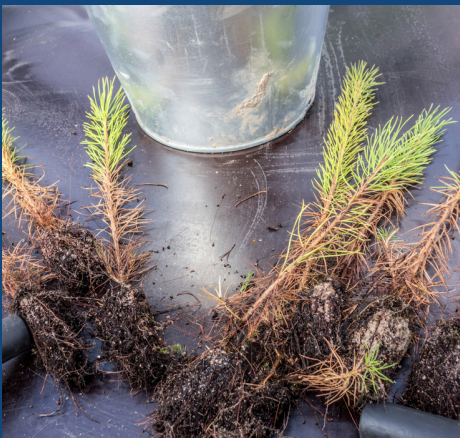
Bare root seedlings ready for planting.