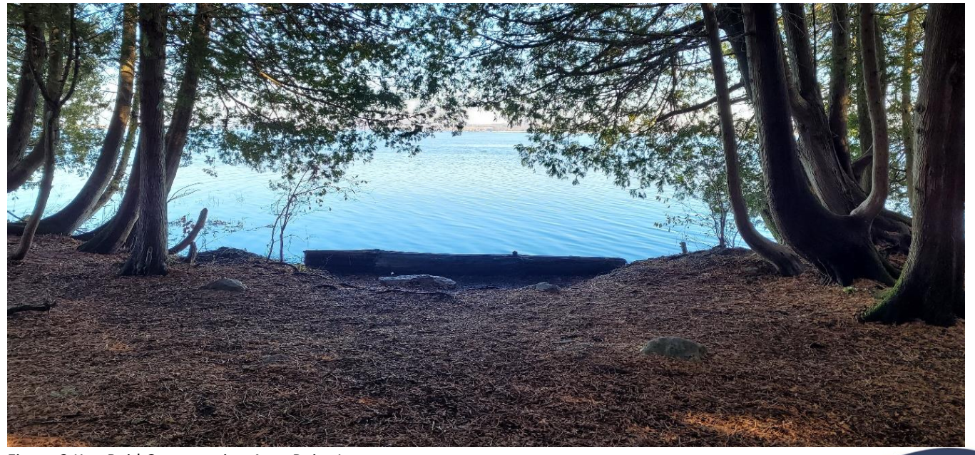
Figure 2 Ken Reid Conservation Area Point Loop

When considering guiding management objectives for environmental health, we found that the criteria outlined on the following page were the most important to our community.