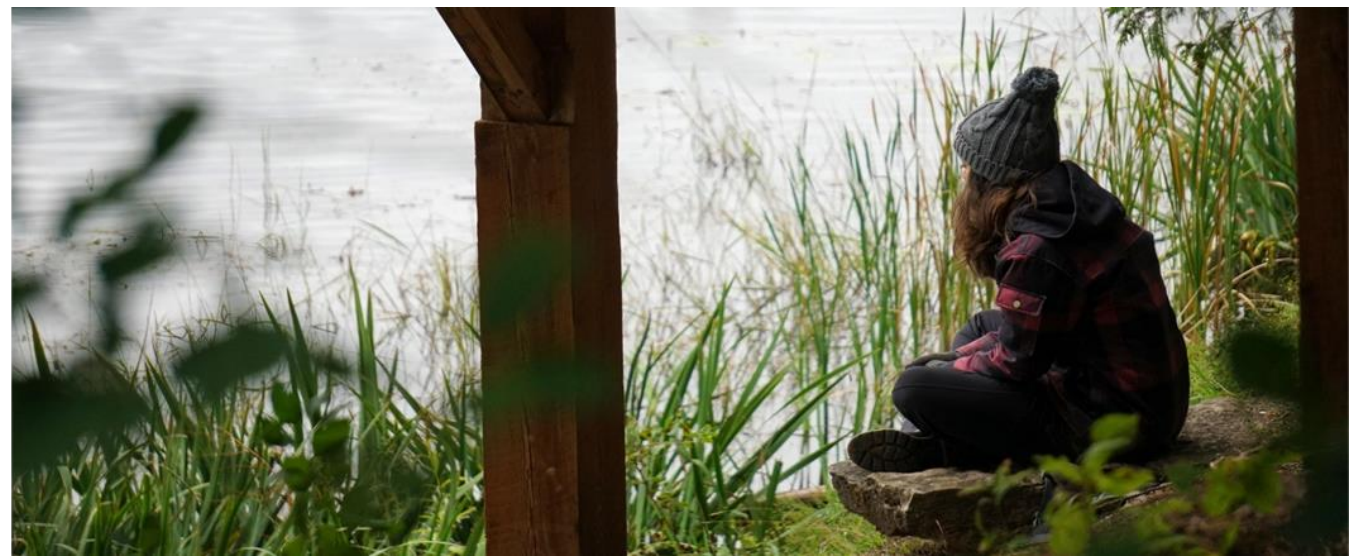
Figure 3 Ken Reid Conservation Area Lookout

When evaluating guiding management objectives for community health, we found that the criteria outlined on the following page were the most important to our community.