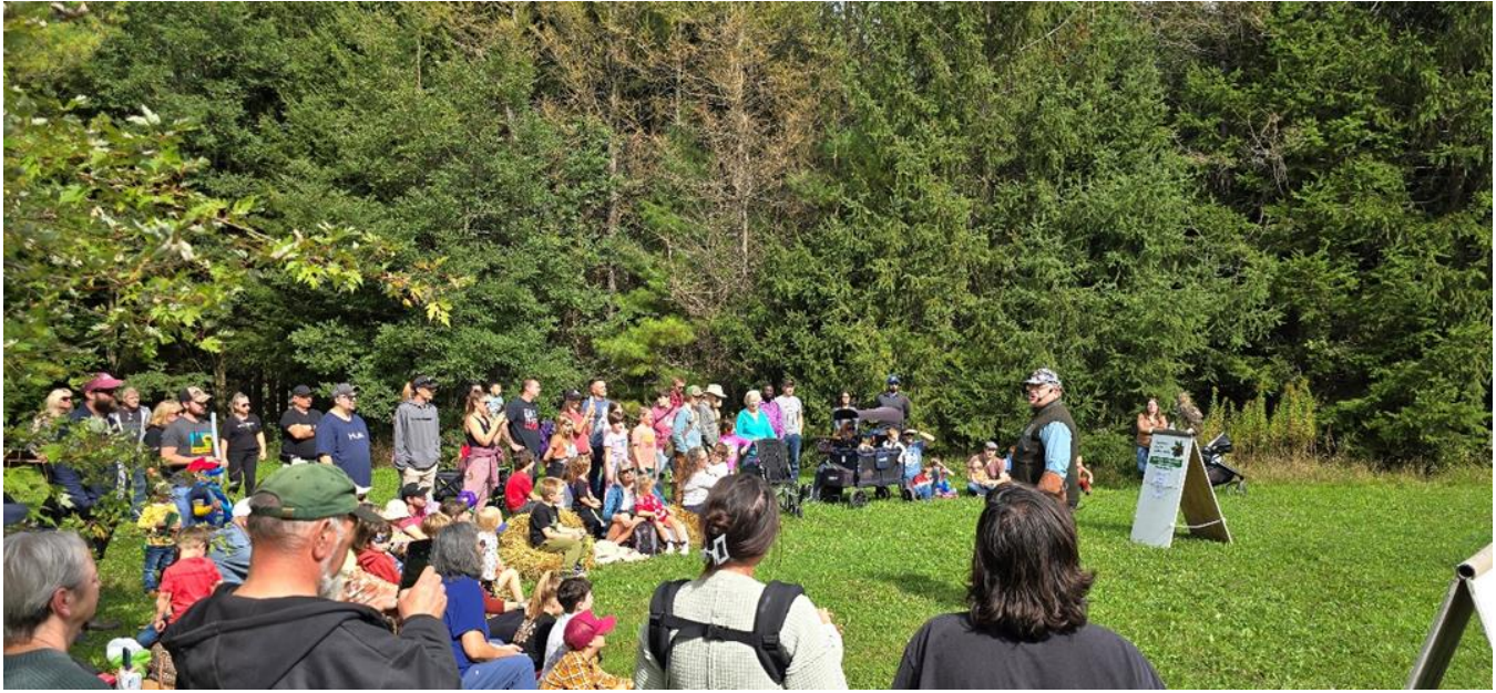
Figure 4 Ken Reid Conservation Area Fall Fest

When considering guiding management objectives for discovery, we found that the criteria outlined on the following page were the most important to our community.